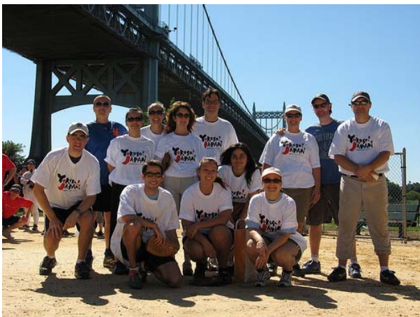
Team JETAA-NY in their Yokoso Japan jerseys