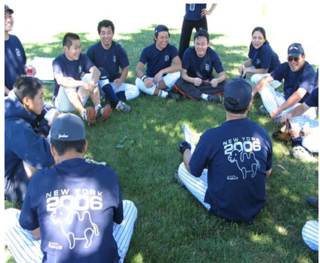
JTB USA's award-winning uniforms, featuring the Rakuda!