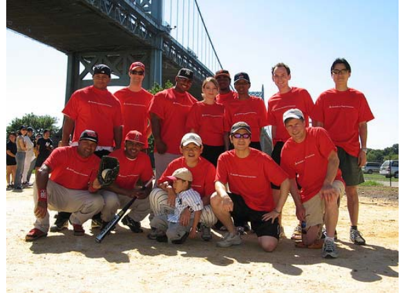
JETAA Softball Tournament Winners Mitsubishi Corp.